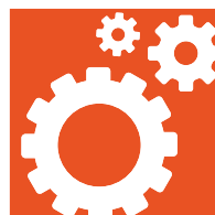
MANAGEMENT BUSINESS LEADER ACADEMY